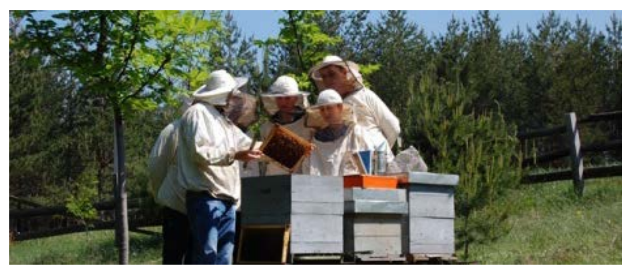
4 Beekeeping Project for Students

Also, visit to International Agricultural Fair in Novi Sad was organized for 143 farmers from Krivaja and Jahorina ADP, where they had opportunity to gain experience and create new business opportunities in contact with international companies and farmers from other markets.