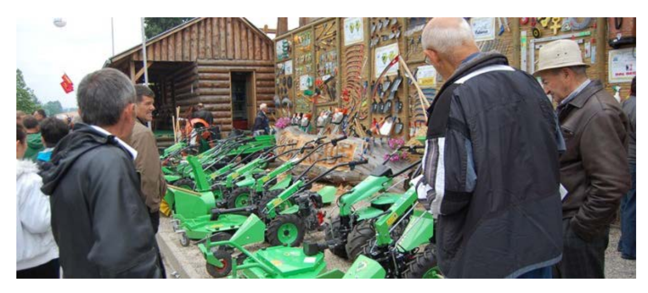
5 Visit to Agricultural Fair in Novi Sad

agricultural projects were supported by World Vision in Lašva ADP and ten loans were approved for parents of children included into Sponsorship program.