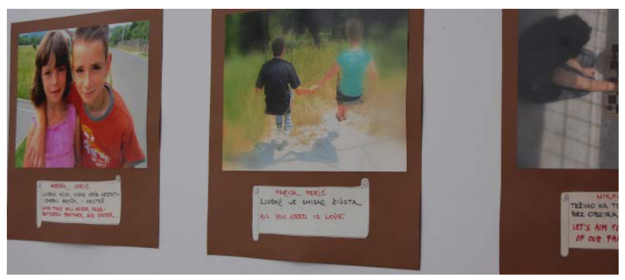
2 Photo messages produced as part of Advocacy for Peace Summer School

school in Pale-Prača municipality; "Inter-Entity Cooperation between schools and students – Path to Future" implemented by community based organization "Pomoć djeci Balkana" enabled for 50 children from ten schools to participate in 10-day learning summer camp. This lead to better understanding among children of different ethnic background, while at the same time event was used to provide additional learning opportunities for children in area of mine awareness, democracy, environmental