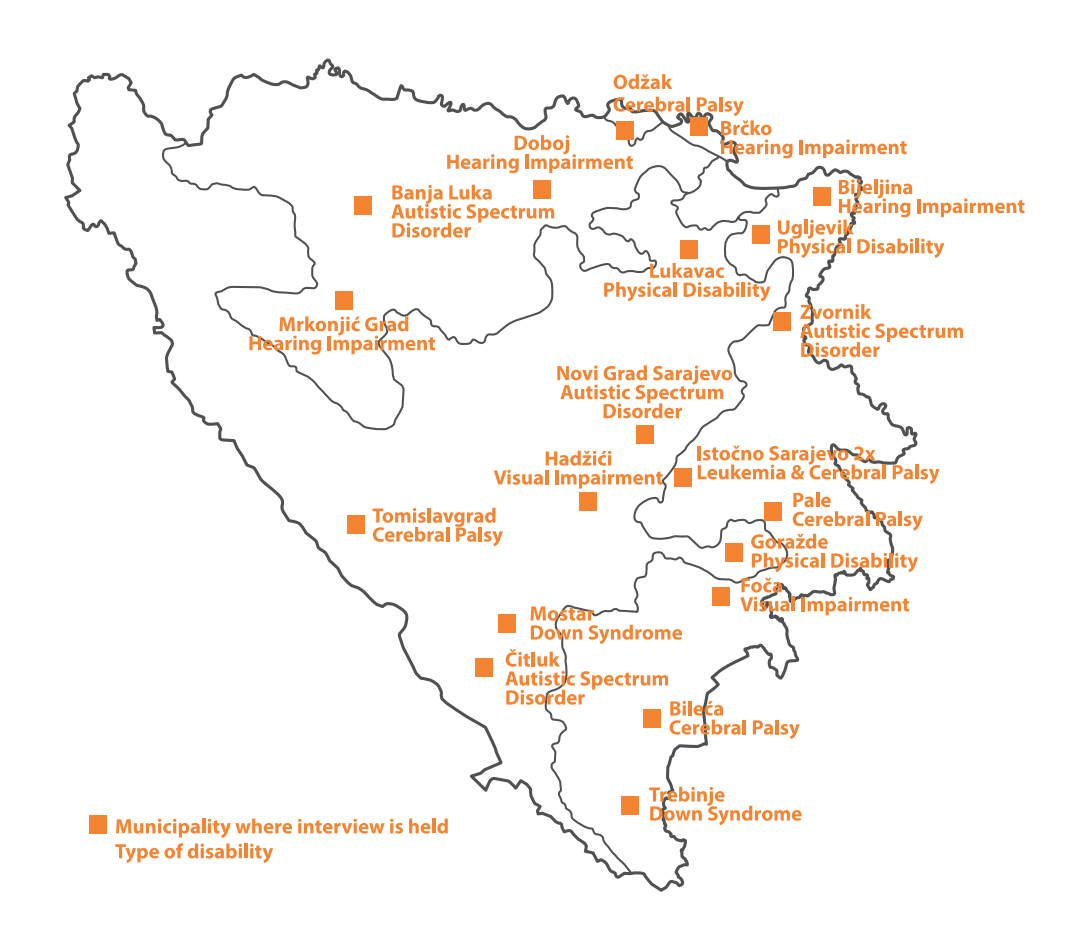
Figure 1. Map of research participants with geographical location and area of disability

Approximately 52% of the children were girls and 48% were boys reflecting the distribution of population by sex in BiH.